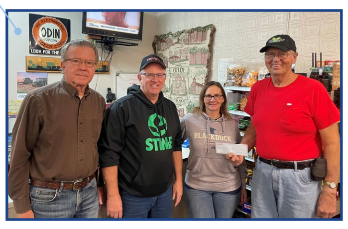
The Odin Community Club received $500 toward kitchen fire suppression equipment.