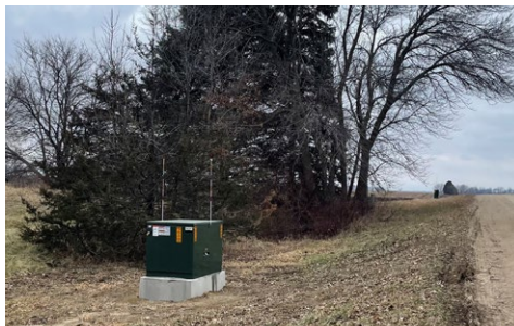
South of LaSalle a new underground three-phase line was run one mile to the south side of town to create a back feed for LaSalle. Pictured is the new three-phase switch cabinet near the Younger Brothers site.

line to strengthen a circuit coming from another substation. By installing the new underground, we did not have to rebuild one and a half miles of three-phase overhead line. In Antrim Township, we rebuilt three miles of three-phase 1/0 line built 1955 with three-phase 4/0 underground. This will also serve as a potential back feed for a line from another substation. South of LaSalle a three-phase line was run one mile to the south end of town to serve as a back feed for LaSalle.