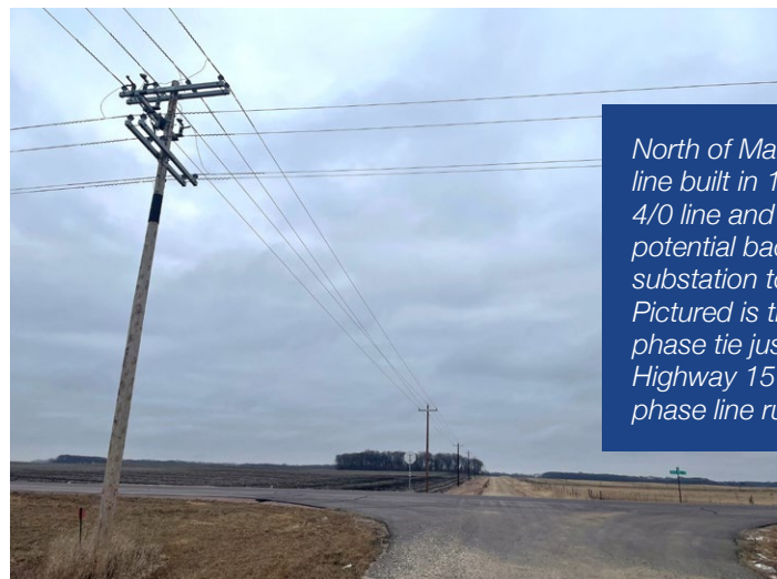
North of Madelia a three-phase 1/0 line built in 1954 was rebuilt with 4/0 line and a tie created to provide potential back feed from another substation to improve reliability. Pictured is the new overhead three phase tie just north of Madelia along Highway 15 with the new three-phase line running to the east.

These projects were all completed along with resolving outages, repairs and member upgrades. We expect a busy 2024 with a number of member projects already on the board. If you are planning a service upgrade you need to talk to your electrician and us as soon as you can. We are still seeing some supply chain issues with a lot of our material. The sooner you let us know, the better we can plan to make sure your project gets completed.